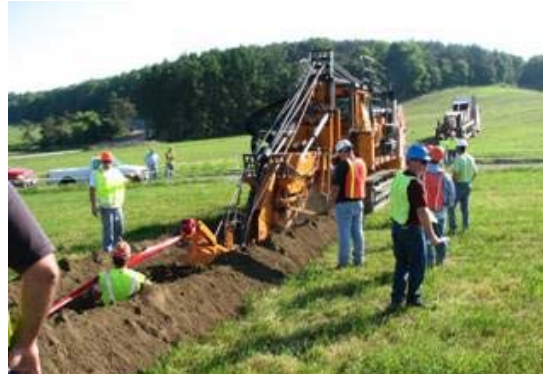
Exhibit 2.6.2 – PLC Trencher

Installation of interconnect cable via an open trench will be avoided, if possible. Areas where open trench installation may be required include unstable slopes, excessive unconsolidated rock, and standing or flowing water. Open trench installation would be performed with a backhoe and would result in a disturbed trench approximately 36 inches wide and a minimum of 48 inches deep. Excavated material would be sidecast immediately adjacent to the trench. In active agricultural areas, agricultural protection measures in accordance with the guidelines of the New